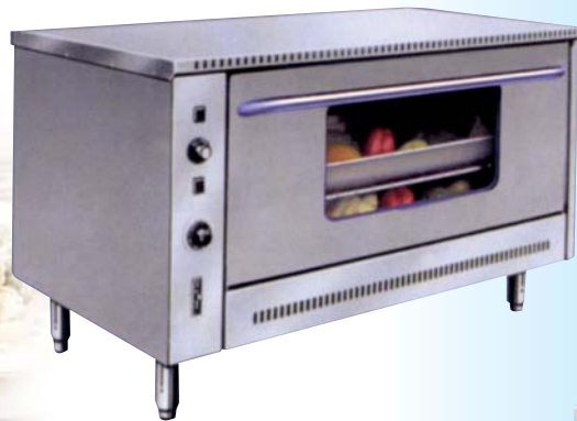
MODEL PE-284, PE-284 FF