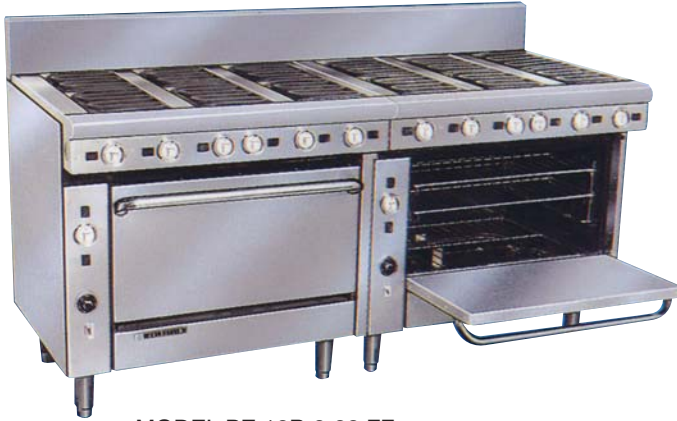
MODEL PE-12R-2-28 FF

ALL GOLDSTEIN STATIC GAS & ELECTRIC OVEN RANGE ARE AVAILABLE AS OPTIONAL EXTRA FAN FORCED UNITS