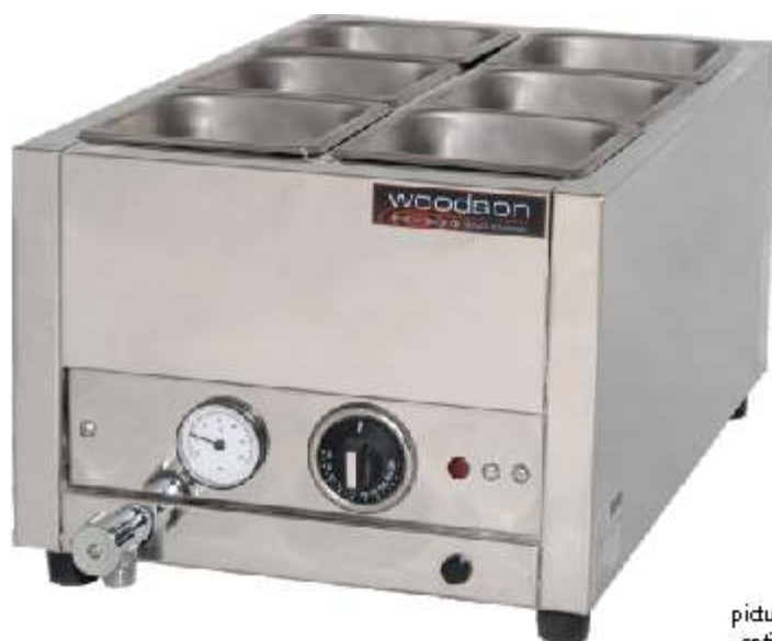
pictured with optional pan combination