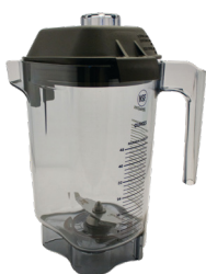
1.4 L Advance Container with Lid and Blade Assembly