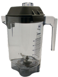
1.4 L Advance Container with Lid and Blade Assembly