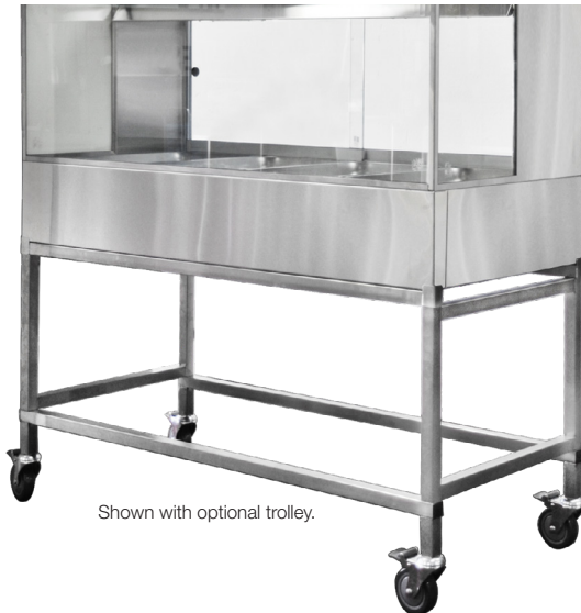
Shown with optional trolley.